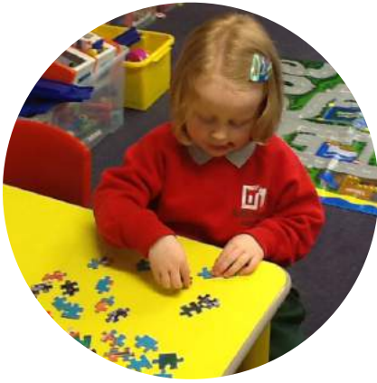
Table Top Play

Jigsaws, activities to explore mathematical concepts and to promote language development